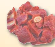
BONE-IN DICED GOAT H.A.M. 5037