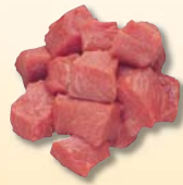
BONELESS DICED GOAT H.A.M. 5251