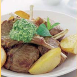
RACK H.A.M. 4931