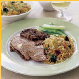
BACKSTRAP H.A.M. 5109